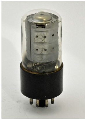
Sola (Sky) by Toshiba (1944)