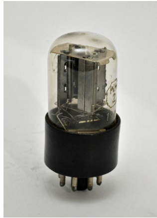
KH-2 by Toshiba (1942)