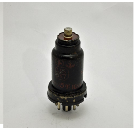
US-6K7 by Toshiba (1938)