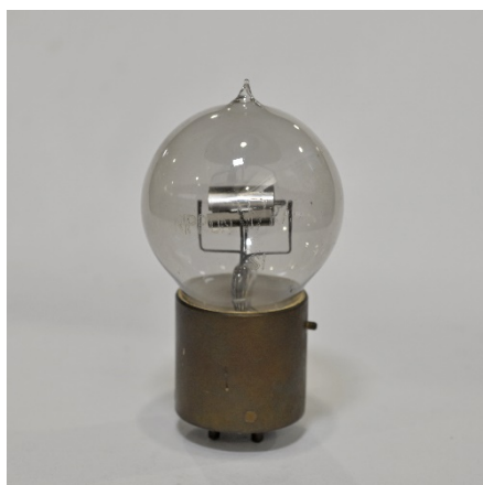
S1 by JRC