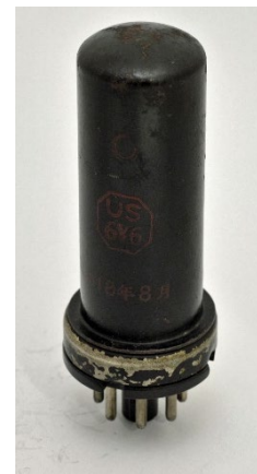
US-6V6 by Toshiba (1939)