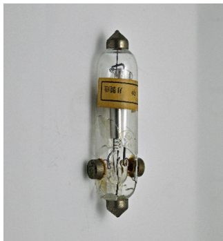
UM-103 (V.24 type) by TEC (1927)