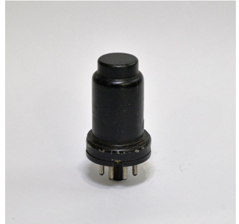
US-6C5 by Toshiba (1938)