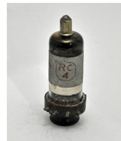
RC-4 by Toshiba