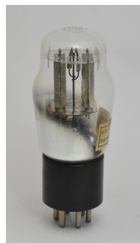
UZ-12C by Riken