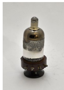
RE-3 by JRC