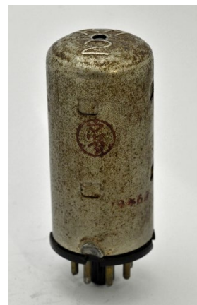
RH-2 by Toshiba (1942)