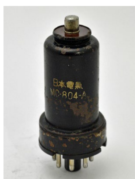
MC-804-A by NEC