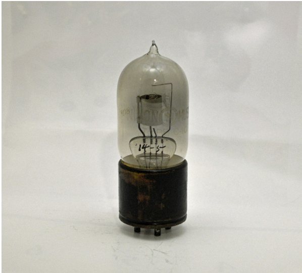
C4C by JRC (1924)