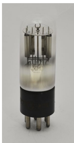
UZ-30MC by Toshiba (1934)