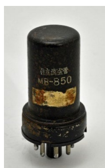
MB-850 by NEC