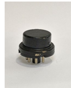
KS-6H6 by Toshiba (1938)