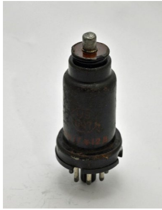
US-6Q7 by Toshiba (1939)