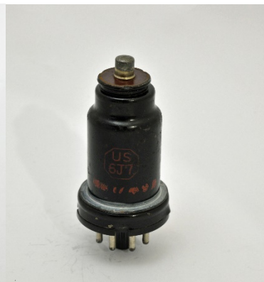
US-6J7 by Toshiba (1938)