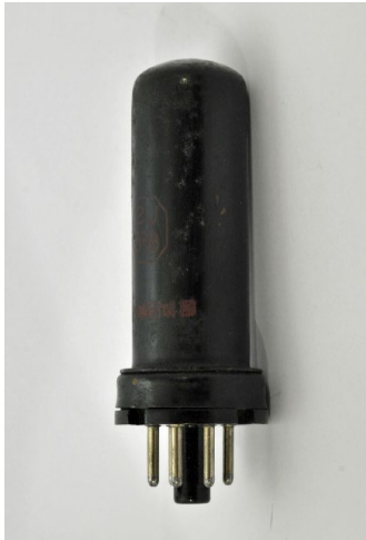
US-6F6 by Toshiba (1938)