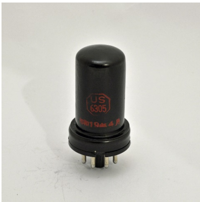
US-6305 by Toshiba (1940)