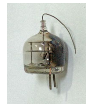
D-11 by Shinagawa