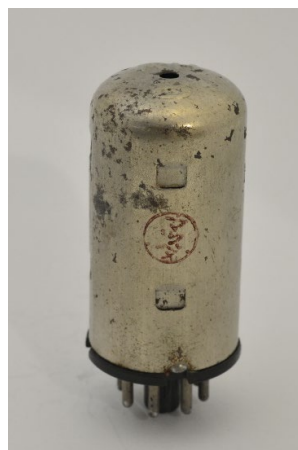
RH-8 by Toshiba (1942)