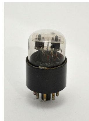
DH-2 by Toshiba (1942)