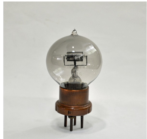
TV8 by Tokyo Radio