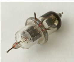
2400 by Toshiba