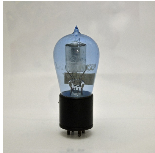
C7 by JRC (1924)