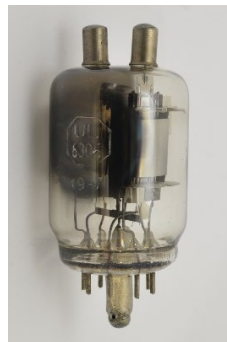
UL-6306 by Toshiba (1943)