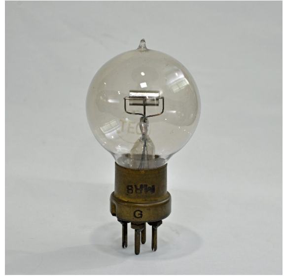
UF-101 (French TM type) by TEC 1919