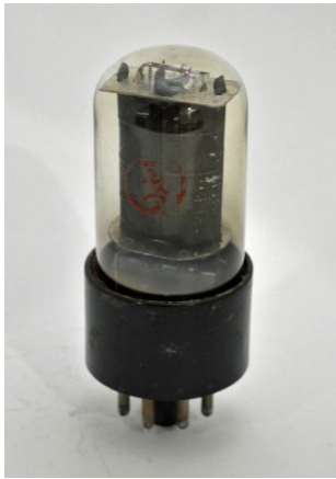
PH-1 by Toshiba (1942)