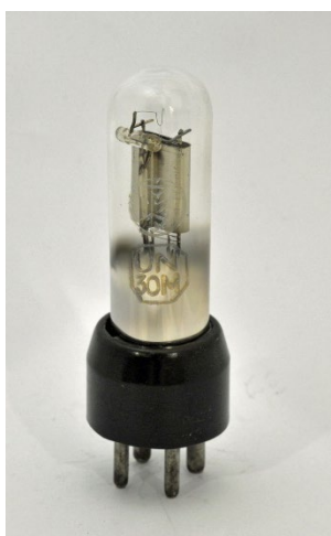
UN-30M by Toshiba (1933)