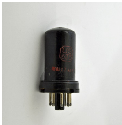
US-6J5 by Toshiba (1940)