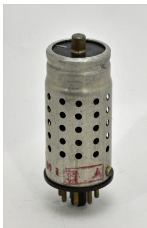
FM-2A05A by JRC