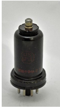
US-6F7A by Toshiba (1939)