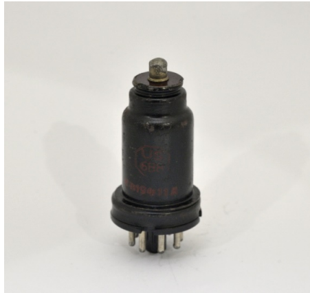
US-6B8 by Toshiba (1939)