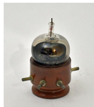
ME-664A by Shinagawa