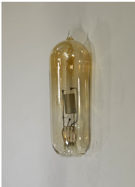
UV-102 (Navy type) by TEC 1920