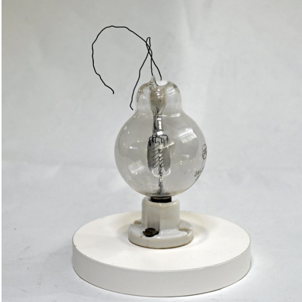
UN-100 (Spherical Audion) by TEC 1917

These Tubes shown here are samples of Early Japanese tubes displayed in the UEC Museum of Communications in Tokyo: