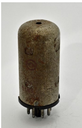
RH-4 by Toshiba (1942)