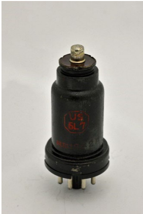
US-6L7 by Toshiba (1938)