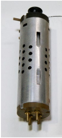
BK20 by JRC